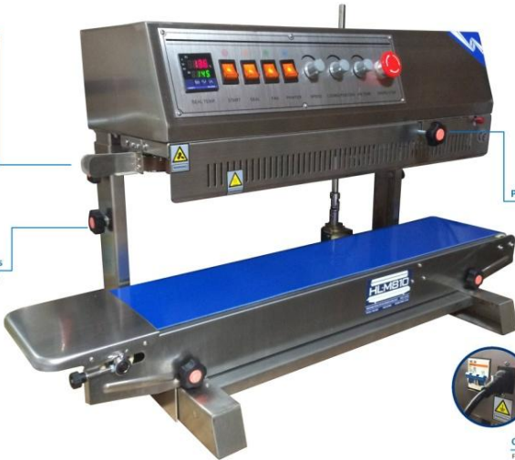
Pressure Knob Adjustment