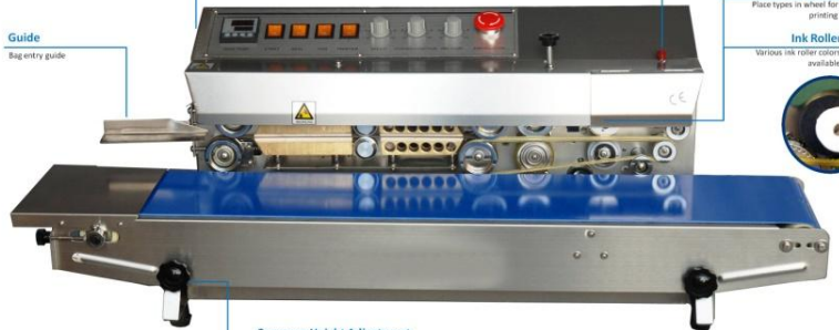
Conveyor Height Adjustment Adjusts height of conveyor table (30-40mm) - Horizontal Only